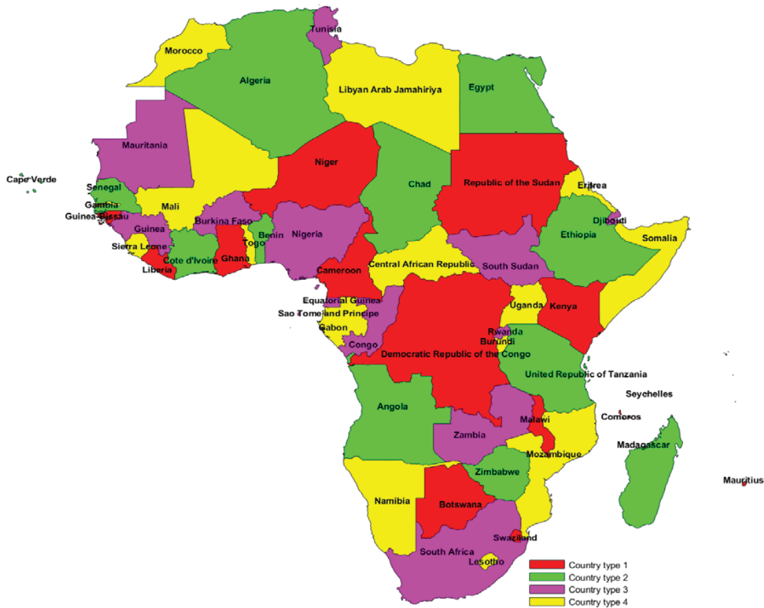
Figure 2: Country type map/PCI distribution map