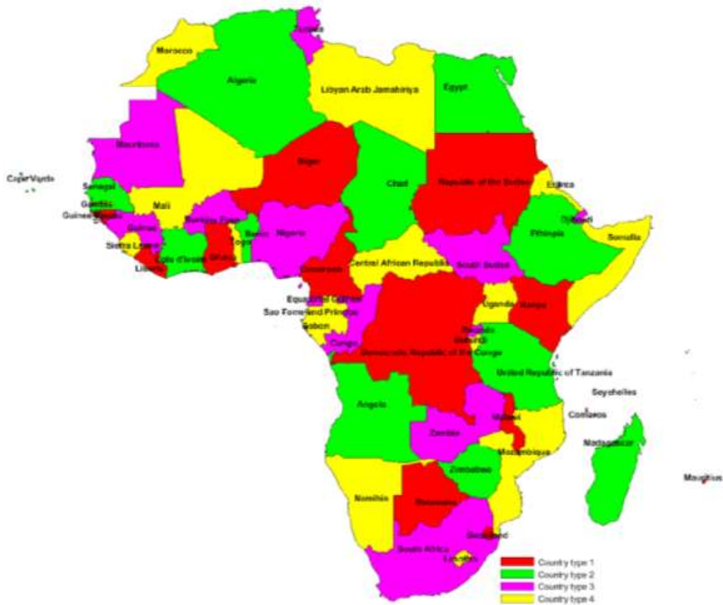
Figure 2: Country type map/PCI distribution map

For each type of country, the following tables and figure describe the sharing of the PCIs with its neighbouring countries, with the following conventions of writing: